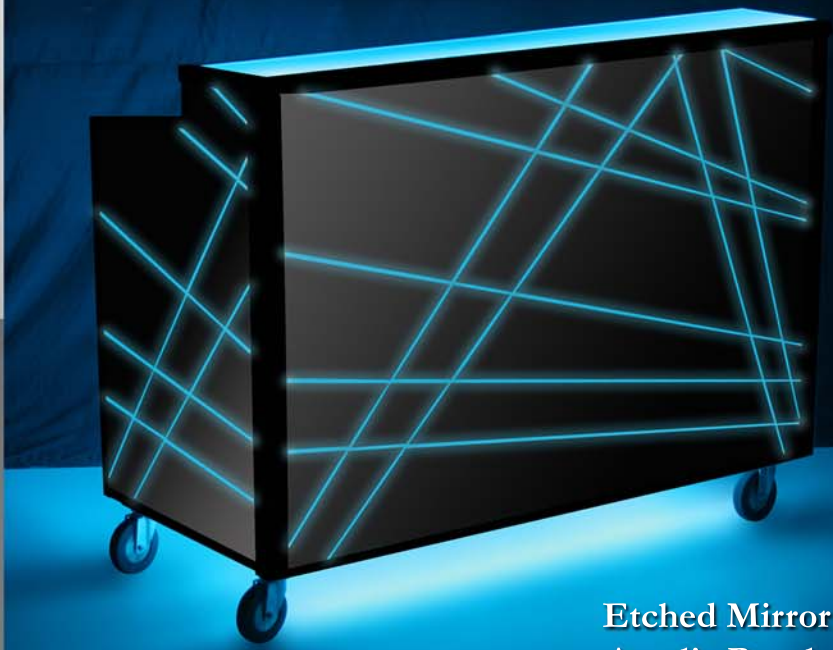
Etched Mirror Acrylic Panels Model 4863-5-S

Remote Controlled LED lighting gives you variable color control and effects at your fingertips in one bar