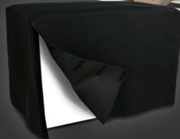
Optional #6285 Padded Cover Available