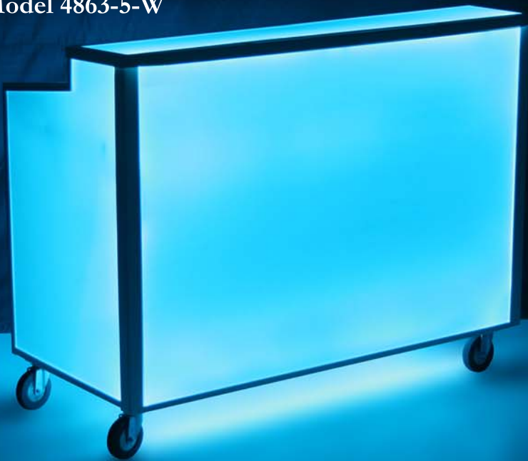
Standard White Acrylic Panels Model 4863-5-W

Call for Pricing and Availability P: 909.923.4559 ~ F: 909.923.1969 Sales@forbesindustries.com